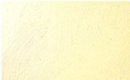
No. 307 (fine grain), toned with AURO Full-shade tinting colour No. 330-10 (yellow ochre), spread using the spreader (semi-circles all over, with swing). Colour may vary from that shown in print!