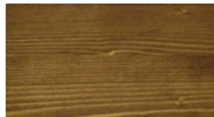
Bangkirai No. 110-85