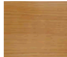
Larch No. 110-89