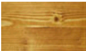
Teak No. 110-81

Rain, sun and daily use can damage wood. Sunlight can cause wooden terraces to turn grey and, combined with moisture-loving fungi and algae, to become unsightly. Protect your wooden terraces by giving them a moisture-controlling, easy-care coating that at the same time also protects the wood against sunlight.